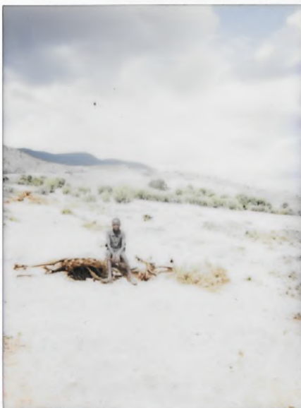
"Boy with Carcass"