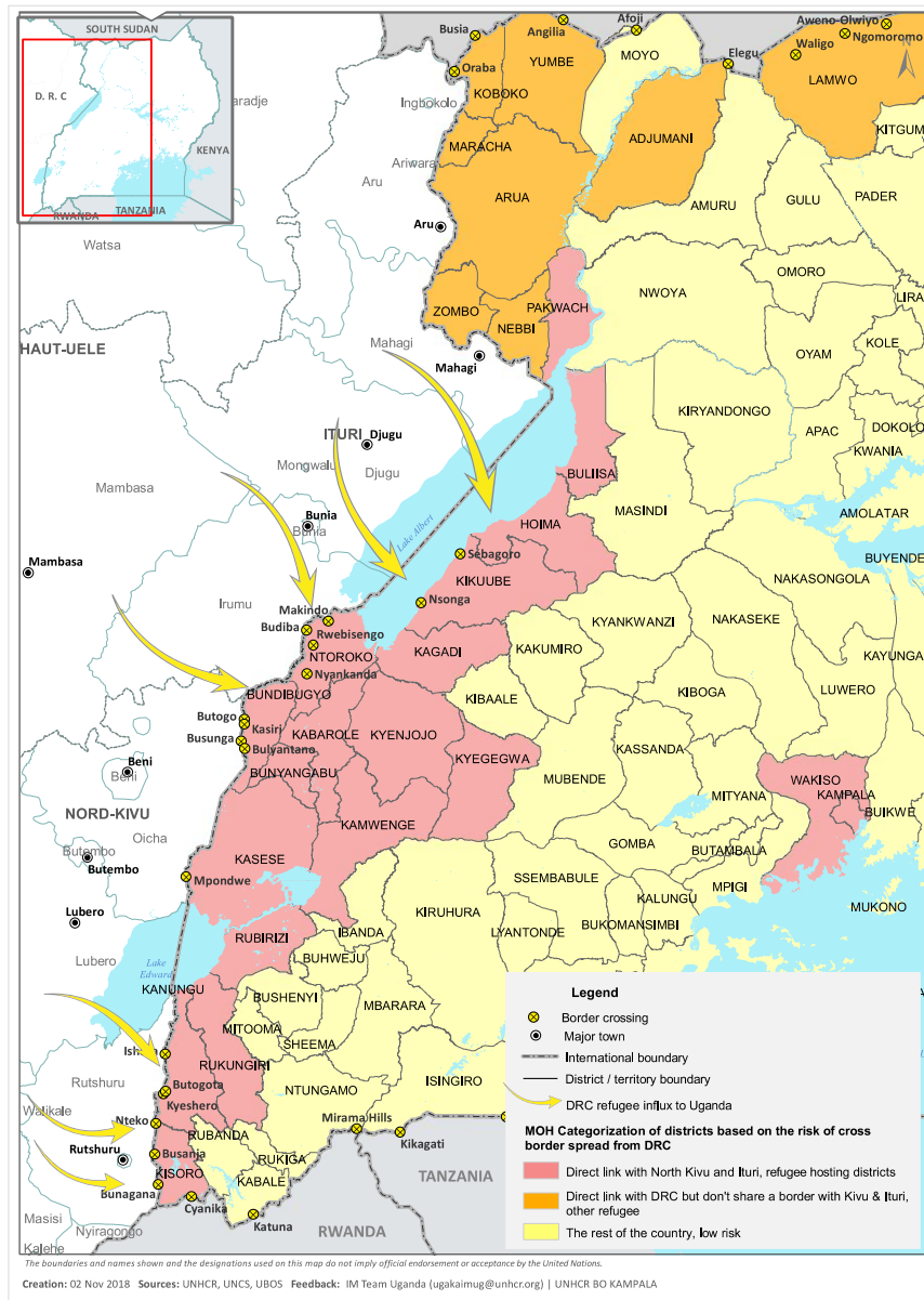
Map 1 – Priority at risk districts (Uganda Ministry of Health)

Uganda Ministry of Health (2018). Uganda National Ebola Virus Disease Contingency Plan. October 2018-March 2019.